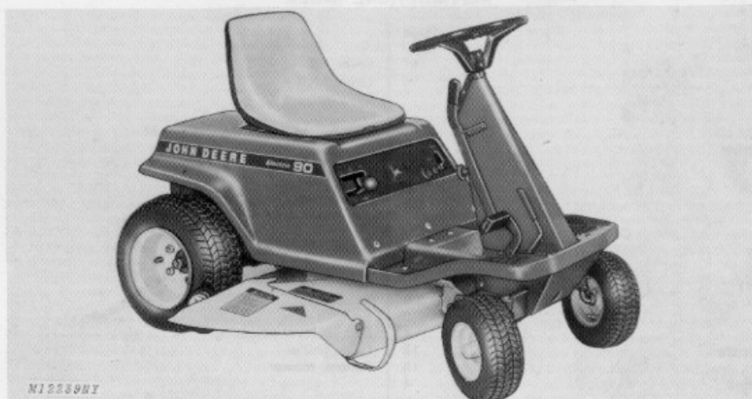
John Deere Electric 90 Mower 1972 Model-Serial No. ( 1001-10,000) 1973 Model-Serial No. (10,001-11,704) 1974 Model-Serial No. (11,705- )

(Specifications and design subject to change without notice)