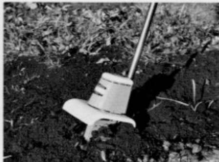
Weeder Cultivator (HC05) makes your shrubby borders look great, keeps the weeds underground. A time saver. Requires extension cord (HT25).