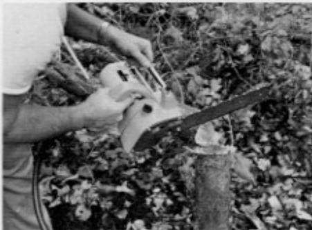
Chain saw (HS13) utilizes tough DC motor to cut logs up to eight inches thick. Thumb operated chain oiler, 13-inch blade.

anywhere, without lengthy 110-volt extension cords. The twist-lock plug prevents pull-out while working. A 25-foot extension cord (HT25) is available.