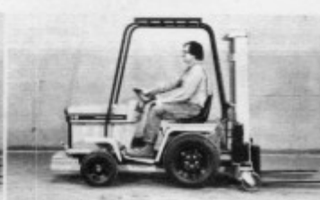
Forklift attachment rear mounted