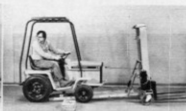
Driver backs off detached forklift