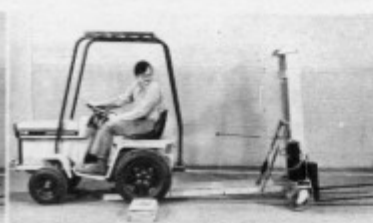
Driver reverses tractor position and backs onto forklift