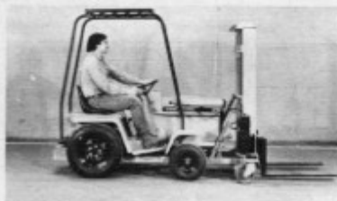
Forklift attachment front mounted