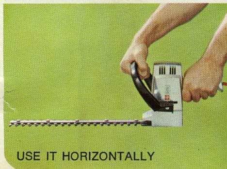
USE IT HORIZONTALLY