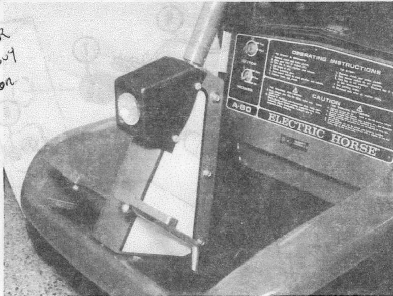
FIG. 1. 8-0840 Light Kit